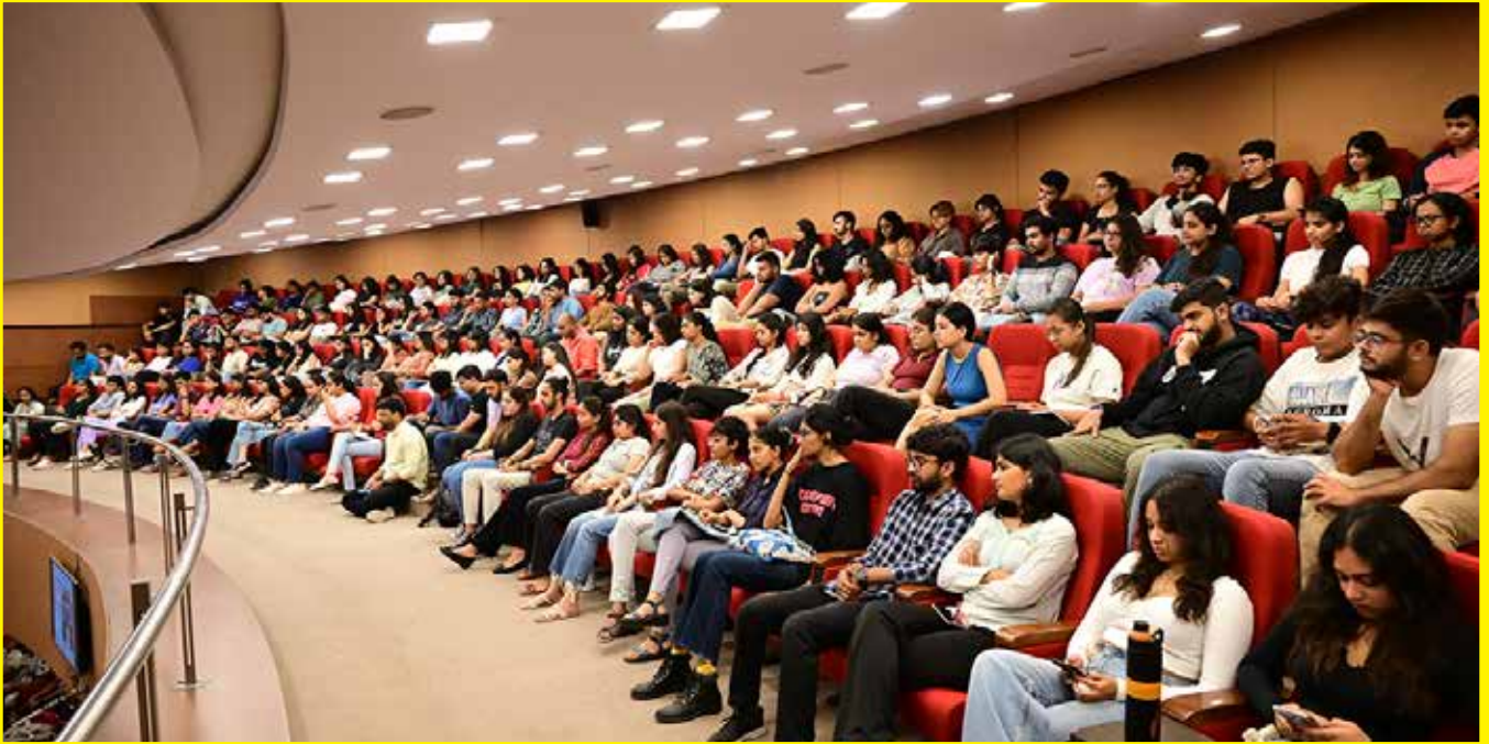
Young designers participating in Svagat 2023 session.