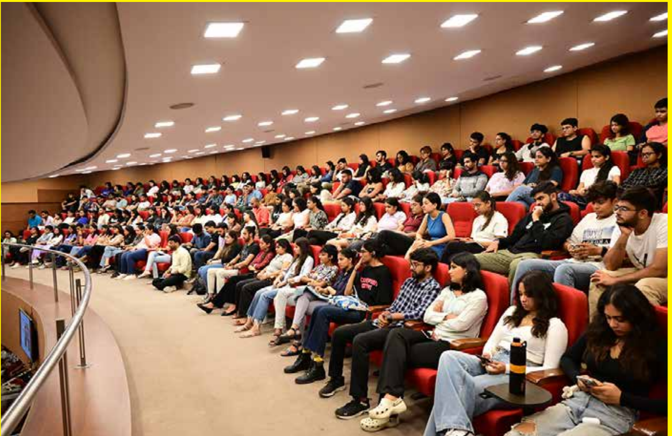
Students gathered for Induction.