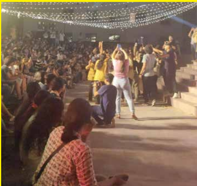
Freshers sing-along at the Amphitheatre.

In conclusion, the induction program was a colourful and enriching initiation into a world where dreams are nurtured, creativity is celebrated, and endless possibilities await. It has left an indelible mark on my artistic journey, shaping me into a more confident and inspired individual, ready to embrace the wonders that lie beyond the horizon.