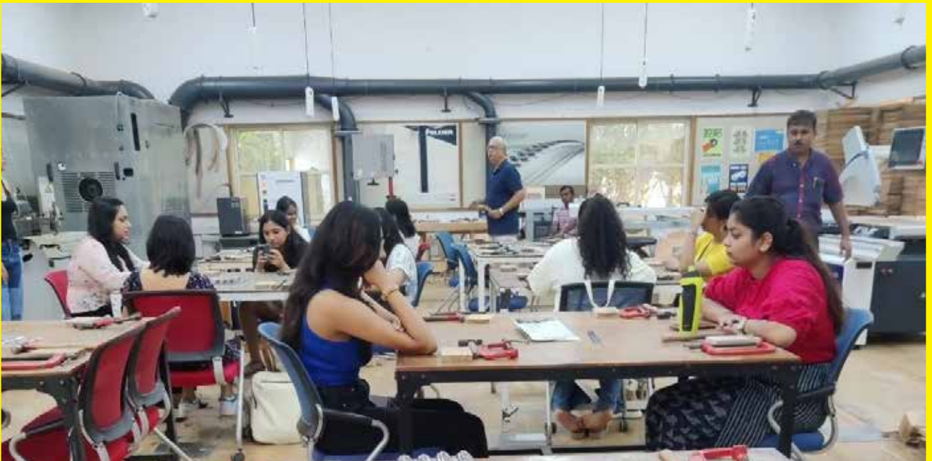
Wood Carving Workshop.