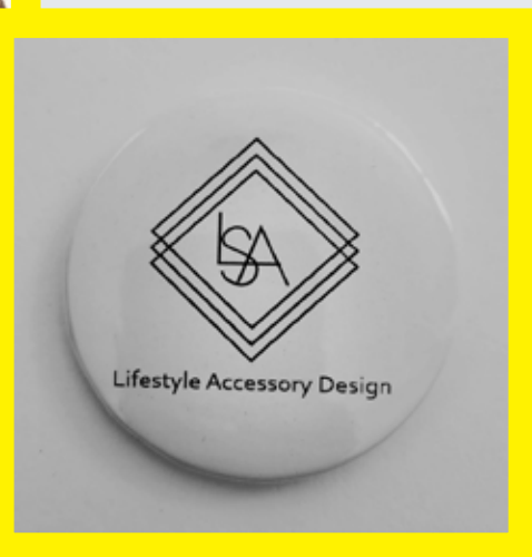
The department head and esteemed faculty members distributed badges to the juniors as a welcoming gesture.