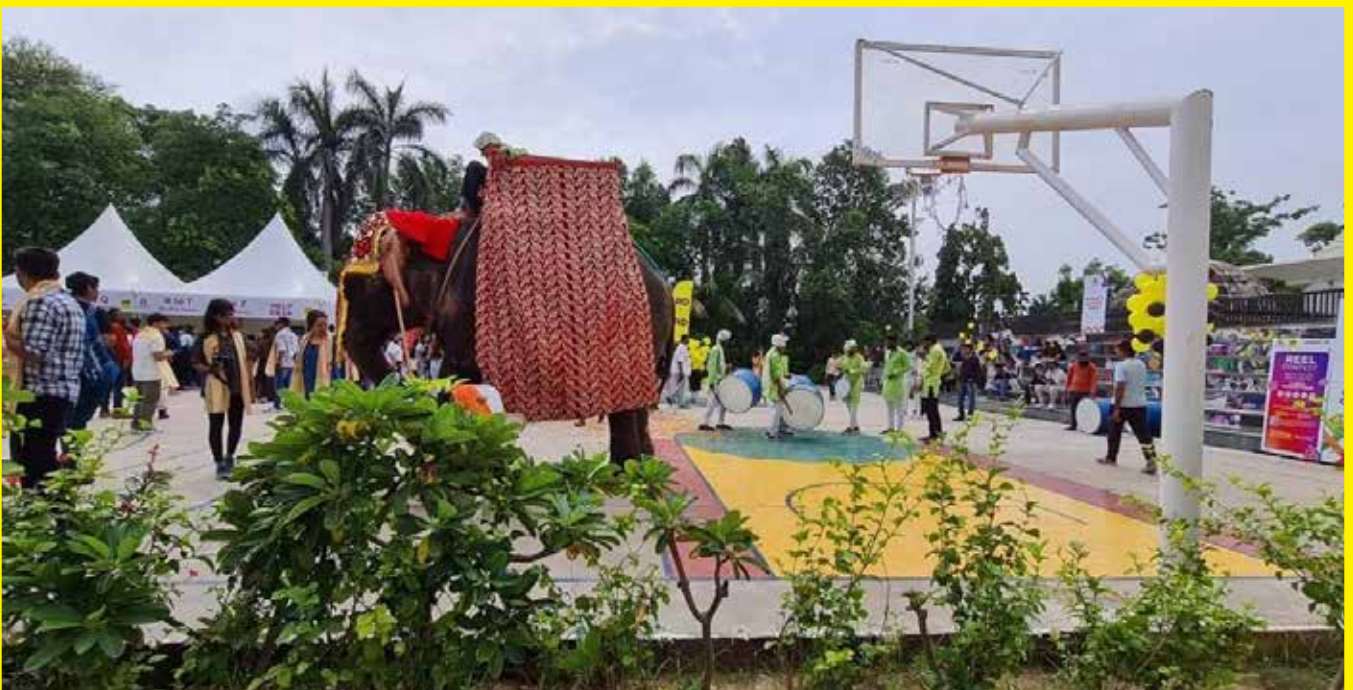
Jumbo Haathi greeting newcomers at the induction festival!

As I glanced at my email, a wave of exhaustion washed over me. I thought to myself, “Three days of induction; I wonder what they’ll expose us to...” The program turned out to be a delightful surprise, passing by in a moment. From the adorable elephant in the basketball court, to the inspiring talk on Menstrupedia, I was completely blown away by the exuberance of the event. The array of workshops brimmed with variety, as a board filled with pegs of assorted sizes. I saw students from various parts of the nation, each carrying their own artistic journeys with a hopeful little smile.