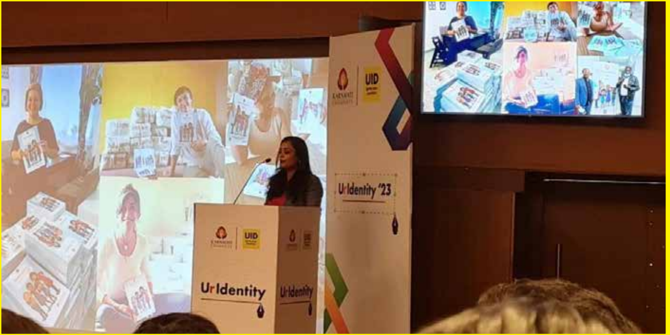
An inspiring story- combating taboos around menstruation with comic strips.

As I reflect on this captivating induction, I am filled with gratitude for the chance to be a part of this incredible community of talented individuals. With newfound inspiration and a sense of purpose, I eagerly look forward to the enriching experiences that lie ahead.