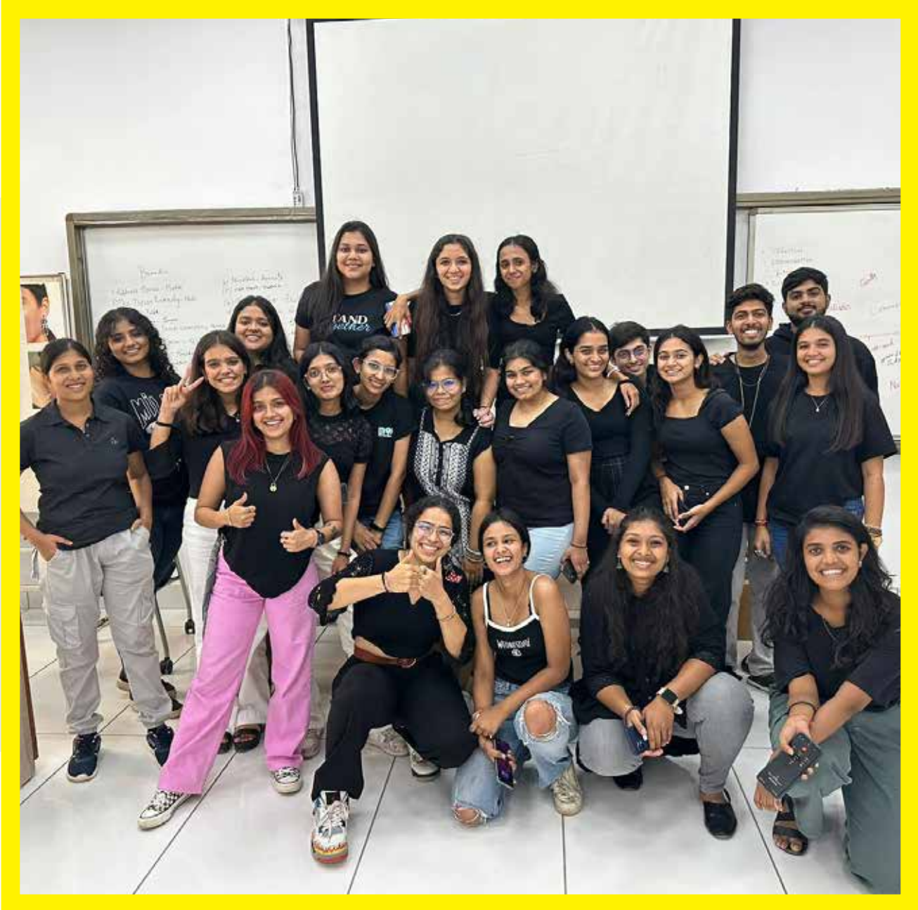
The students of the Lifestyle Accessory Design department come together for an interaction.

The event included a cultural showcase segment to celebrate the diversity and talents of the college community. Both senior and junior students participated by showcasing their artistic abilities through music, dance, poetry, and dressing up according to a theme, in addition to that the senior students gave juniors pizza chunks as a sign of love and appreciation. This atmosphere fostered respect, support, and friendship between students of different class levels, resulting in a welcoming environment that promotes teamwork, academic performance, and a sense of belonging for the lifestyle accessory design student body.