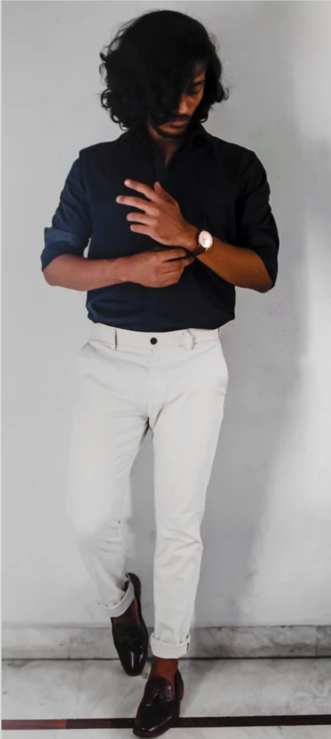
The Gentleman Look.

This is the best look for first dates, parties etc. It is a semi-formal look that makes you look sophisticated and confident. Just grab your chino and dress it up with a formal shirt. I would prefer a dark coloured shirt over light chino so that they can complement each other and then pair it with loafers to get that classic luxury vibe.