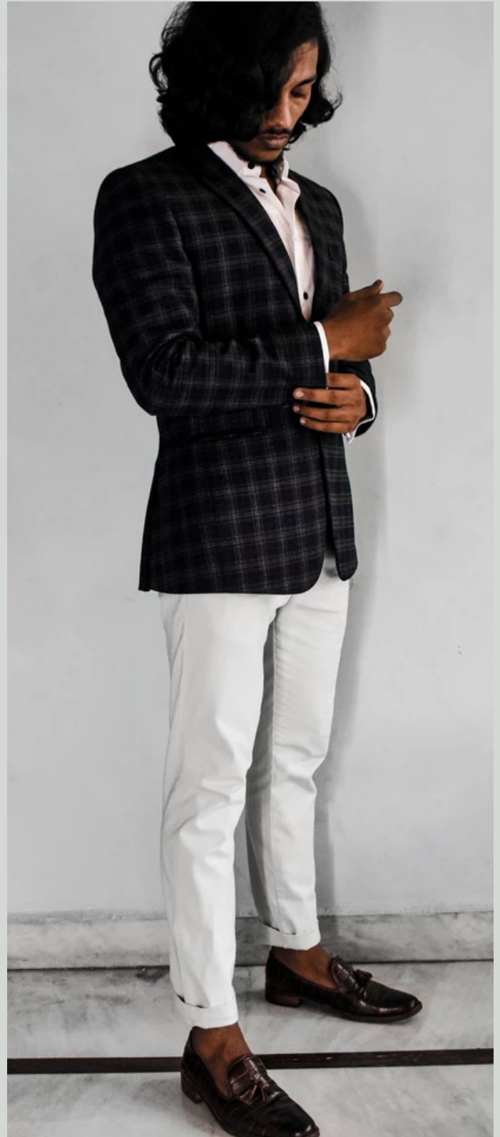
The Business Casual Look.

This look gives an entrepreneur vibe. Just put on a blazer over the whichever t-shirt/polo/shirt you are wearing with a chino. Remember blazers should have a little contrast with chino pants for the look to stand out.