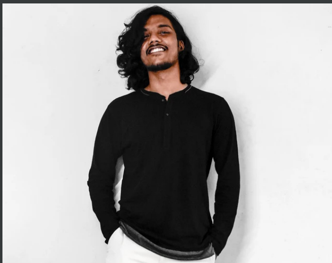
The Playful Look.