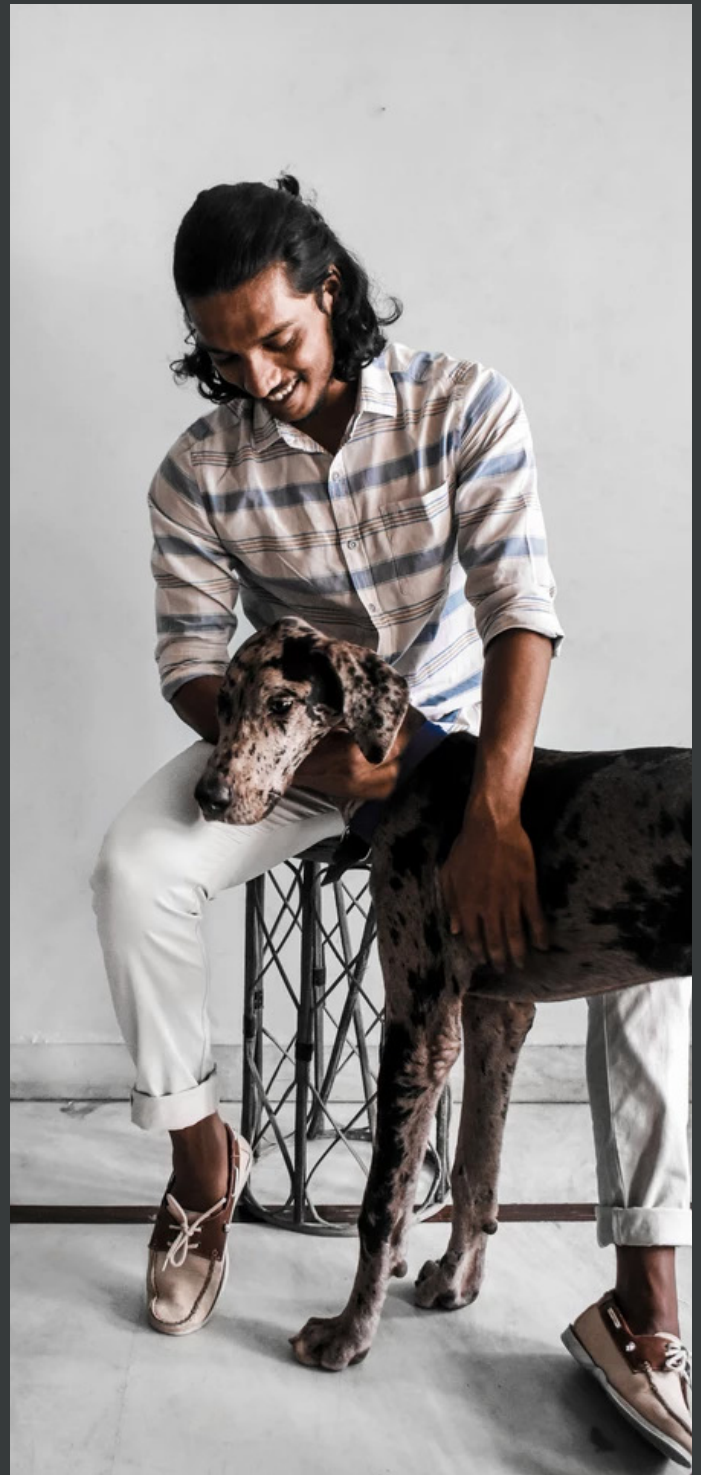
The Vacation Look.

Always confused about what to wear on vacation. Just grab a chino and a printed shirt. This is the perfect look for starting your vacation. Combinations are endless. You can pull off the same chino with a different shirt and you got yourself a vacation wardrobe. Add sneakers to get that vacation vibe going.