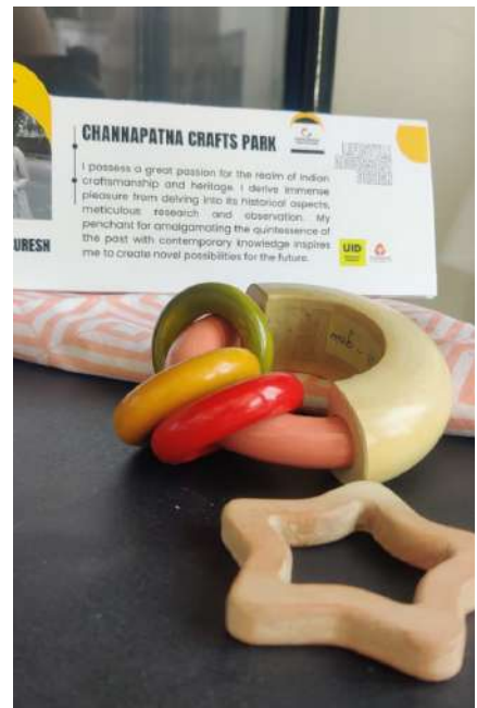
Some beautiful highlights from graduation work display.

As we triumphed through each semester, our proverbial treasure troves overflowed with invaluable experiences, unforgettable moments shared with friends who became our chosen family, mentors who guided us with unwavering patience, and classmates who propelled our personal growth.