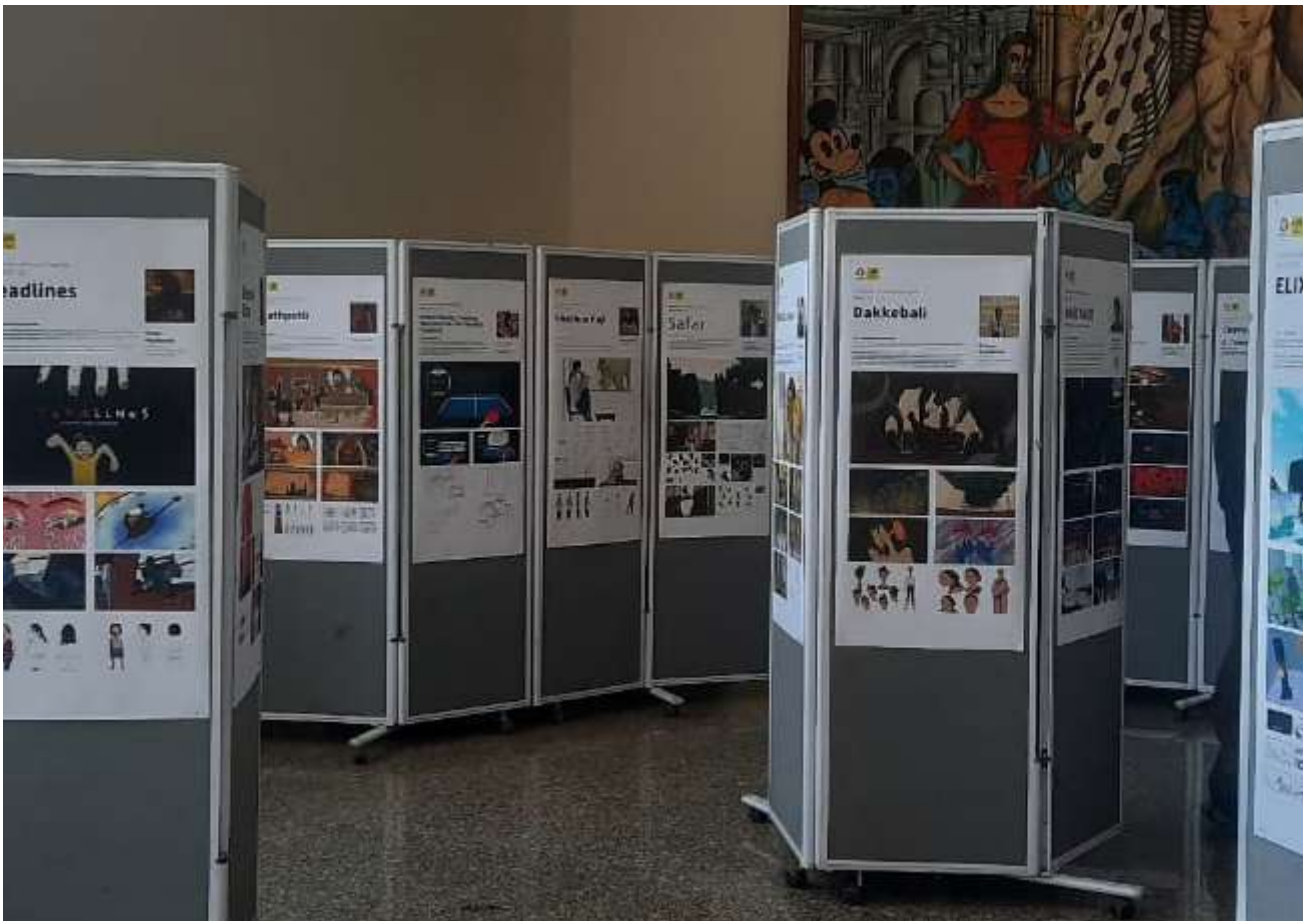
Display of students work.

The breadth of projects on display was astounding, encompassing a diverse spectrum of artistic expressions. From the magical realms of animated films to the immersive landscapes of game design, from the evocative narratives of graphic storytelling to the dynamic motion graphics, each project showcased the students' dedication, passion, and relentless pursuit of pushing the boundaries of animation.