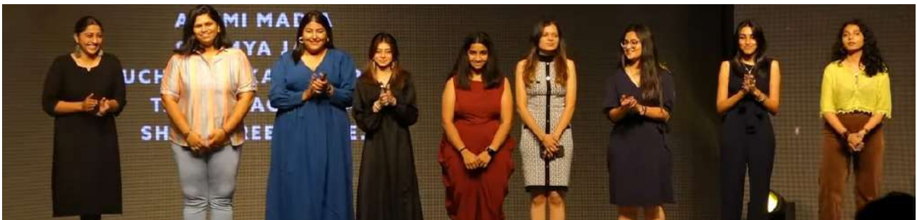
Students of batch 2019–2023, celebrating their graduation show.

Unitedworld Institute of Design proudly presented “BE LIV IT,” a grand graduation showcase that marked the remarkable milestone achieved by the final semester students of Lifestyle Accessory Design. We, as the batch of 2019–23 embarked on an unforgettable four-year educational journey at Karnavati University, where we honed our skills and creativity through a final graduation project undertaken in collaboration with renowned companies and brands. From mesmerizing men’s jewelry to exquisite traditional gold, silver, and precious pieces, luxurious everyday jewelry with a touch of 2023 chic designs, captivating toys, innovative footwear and bags, and intricate ceramics, the showcase became a testament to our dedication and artistic prowess.