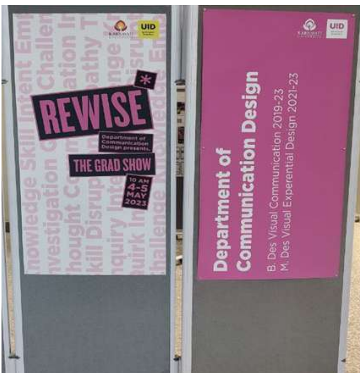
Display at the event.

The Department of Communication Design, UID in collaboration with IIC, KIIF, and SSIP, recently hosted an exceptional event, 'Rewise: The Graduation Showcase 2023.' This two-day event, held on the 4th and 5th of May, provided a platform for the graduating B.Des. and M.Des. students to exhibit their diverse and ground-breaking projects. The event served as a celebration of design, creativity, and the immense potential of innovative thinking.