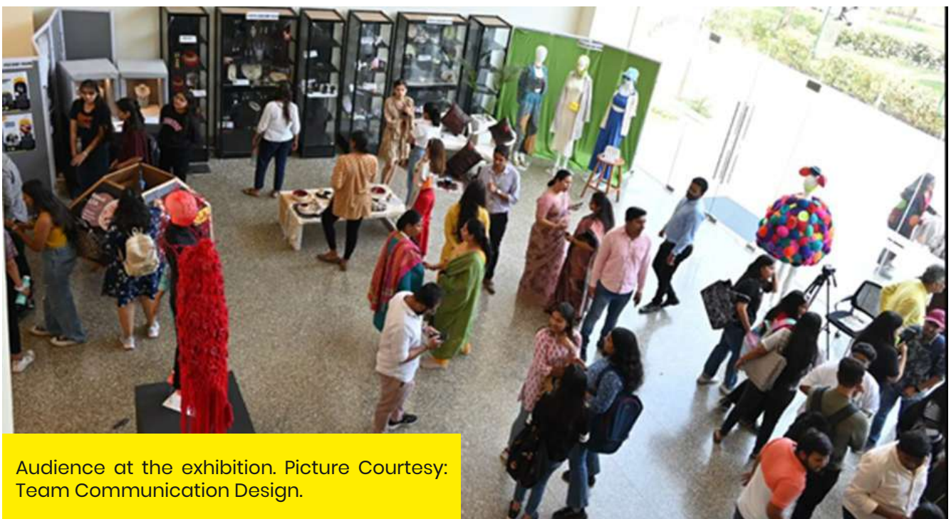
Audience at the exhibition.

As the curtains closed on the event, it became clear that the students' artistic expressions and innovative projects had touched the hearts and minds of all those in attendance. This remarkable celebration of design and creativity will undoubtedly serve as a stepping-stone for the graduating students as they embark on their professional journeys, armed with the skills and experiences gained during their time at UID.