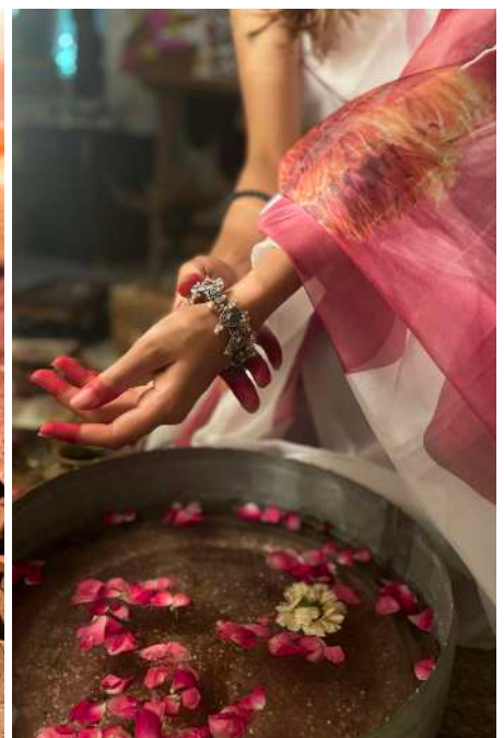
Other Silver Kundan Jewellery product categories designed by me.