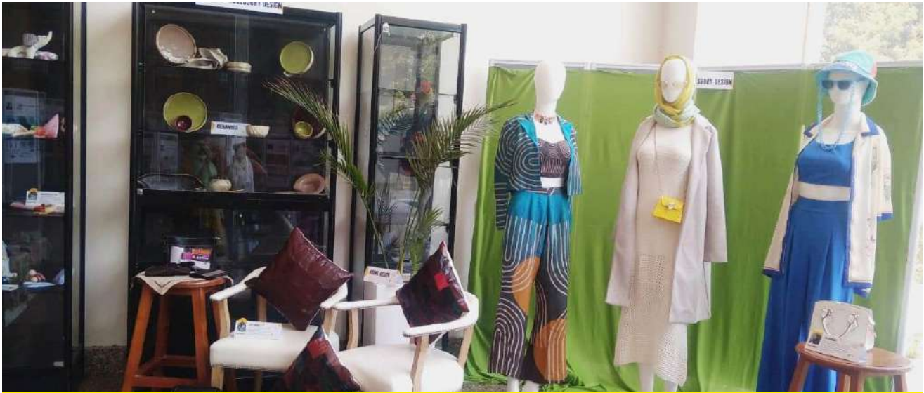
Display of student work.

The impeccably styled accessories and garments, highlighted the designed jewelry, bags, and other accessories, enrapturing the senses and igniting a profound sense of elation within us. The seamless fusion of design elements and meticulous attention to detail evoked an overwhelming sense of joy, filling our hearts to the brim with sheer delight.