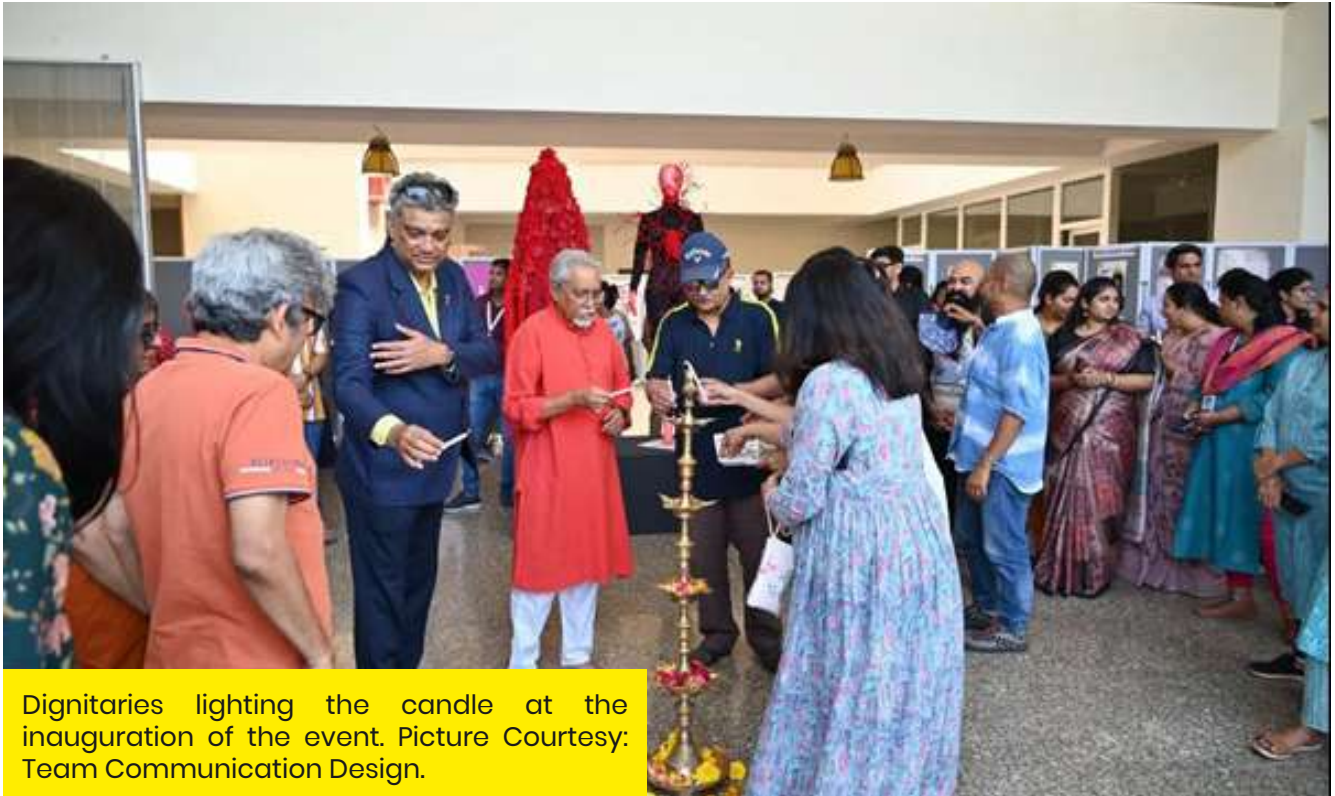
Dignitaries lighting the candle at the inauguration of the event.

The Graduation Showcase 2023 at Karnavati University left a lasting impression on all who attended. It not only celebrated the students' remarkable achievements but also highlighted the university's commitment to fostering a culture of innovation and excellence in design education. The event served as a reminder of the immense potential of design to address societal issues and transform the world