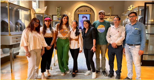
Me with my office team.