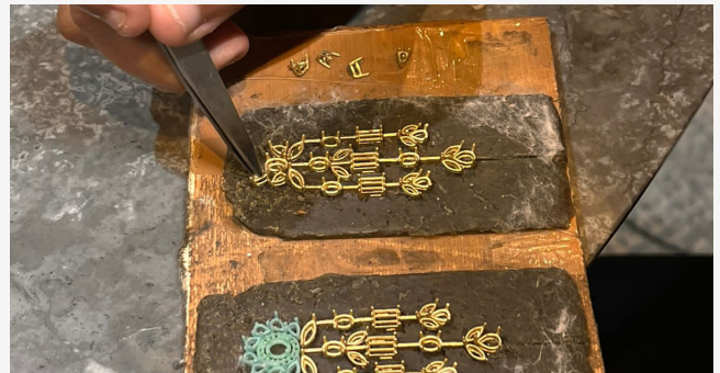
My design in making process at factory.