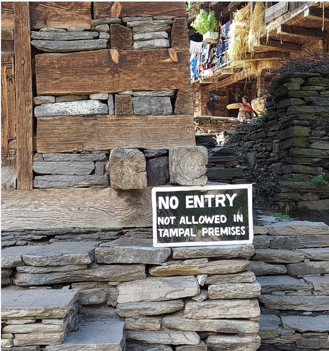
Signage stating-No Entry, Sharan village, Kullu. Temple with no idol inside with access for only village Pandits, Sharan village, Kullu.

Asmi Gugale, B. Des Interior Design, Sem III, UID