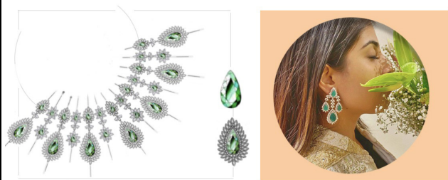
My earring design final look in emerald gemston.

I am glad to have experienced working in a store that bridged a gap between studio learning and industry functioning. My role entailed forecasting trends, understanding customer and market needs, and designing jewellery pieces accordingly. Along with this, I helped with store displays, photo shoots, few sales and interactions with the clients. I got to see the manufacturing process during workshop visits, learn about the pricing and access the final pieces. This project also taught me how to work within a team, from consulting the design head to interacting with and communicating the designs to the artisans and manufacturing head, as well as assisting and learning from the sales team.