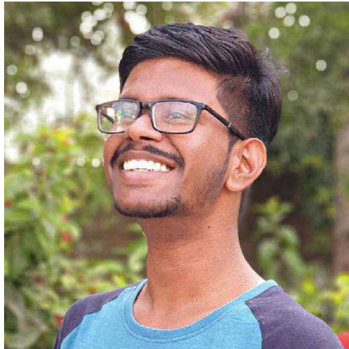
Rahul Hareesh