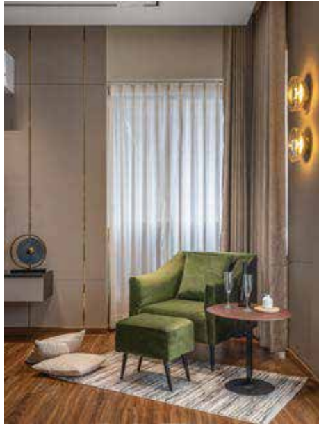
Residential House Of Ahmedabad Published In Architect And Interiors India