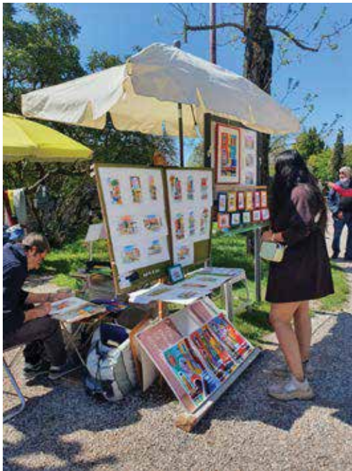
Exploring Streets In Venice

Domus Academy. I've Had The Opportunity To Collaborate With Talented Students From All Over The Globe, Exchanging Ideas, Cultures, And Perspectives. It's A Melting Pot Of Creativity And Inspiration!