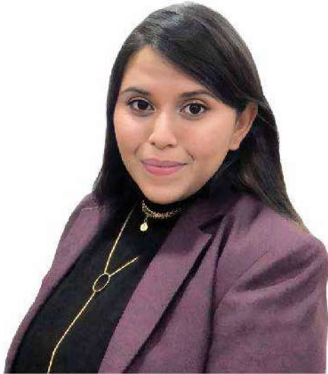
Avani Shah