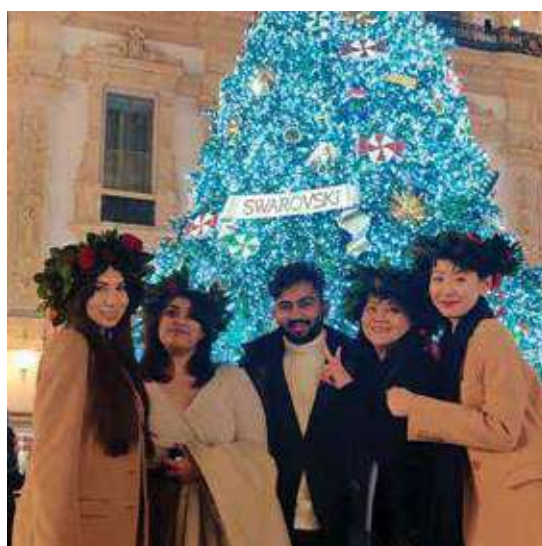
Celebrating our graduation in the centre of Milan.

I Was Scouted By One Of My Professors Who Evaluated My Final Thesis At Domus Academy To Join A Massive Project Immediately After Graduation For A Belgian Company, The Board Of Innovation, In Collaboration With The Design Studio London.