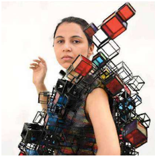
Anirudh's Design At The Wow Show