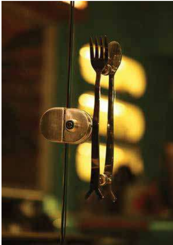
Photo Of The Café Entrance: Project Courtesy: Architects And Interiors India Magazine

The Table Top In Full Body Vitrified Tile Is Complemented By Customized Seating In Plush Fabrics, Art Deco Patterns At Every Turn, Peach Tinted Mirror, Mint Crush Fluted Wall, And Glimmering Wall Scones From The Whiteteak Company In Cognac-tinted Glass And Matte Gold-finished Metal Frame. They Wanted The Space To Have A Distinct Vibe During The Day, Evening, And Night. Soft Sunset Hues Are Ideal For The Day-to-night Transition. It Is Bright And Uplifting Throughout The Day, And It Diffuses Light With A Cheeky Glow At Night.