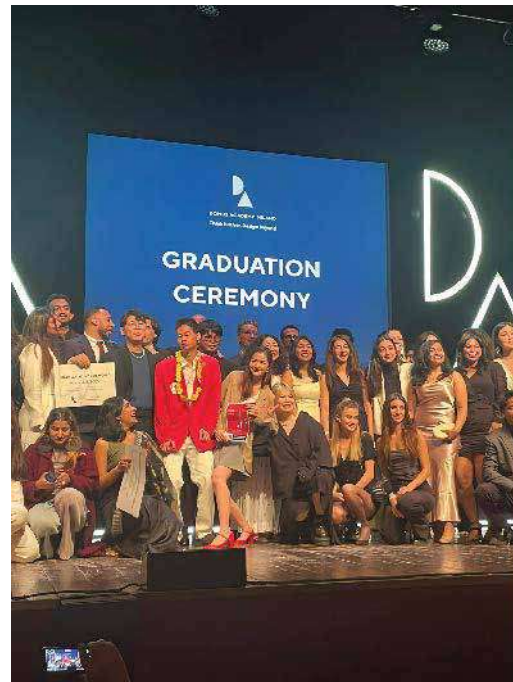
Graduation Ceremony, Domus Academy

Overall, My Journey Through Milan's Domus Academy And London's Regent's University Has Been An Incredible Chapter In My Academic And Personal Development. Domus Academy's Vibrant And Cosmopolitan Atmosphere Provided The Ideal Backdrop For Creative Exploration, Where I Honed My Design Skills Under The Mentorship Of Experts In The Field. The Emphasis On Hands-on Learning And Collaborative Projects Deepened My Understanding Of Design And Prepared Me For The Dynamic Industry. Transitioning To Regent's University London Broadened My Horizons, Fostering Critical Thinking And Offering Diverse Perspectives From An International Student Body. Engaging With Leading Industry Professionals And Utilizing Cutting-edge Resources Enriched My Academic Experience Further. These Two Institutions Not Only Expanded My Knowledge But Also Shaped My Character, Making Me A More Globally Aware And Empathetic Individual.