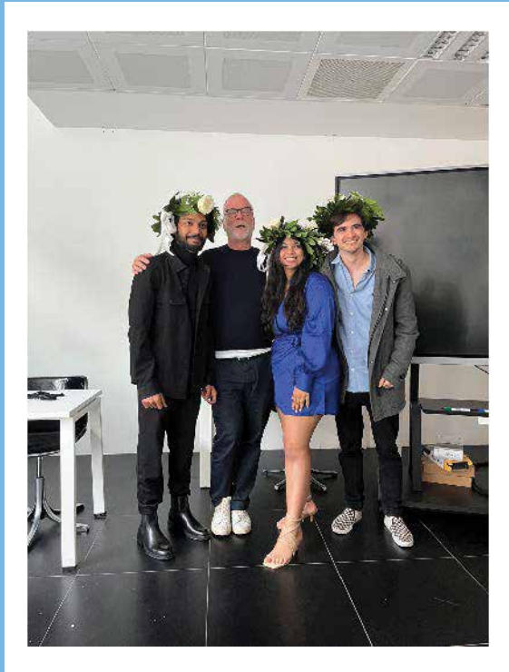
Muvad Final Presentation Results, Domus Academy, Milano