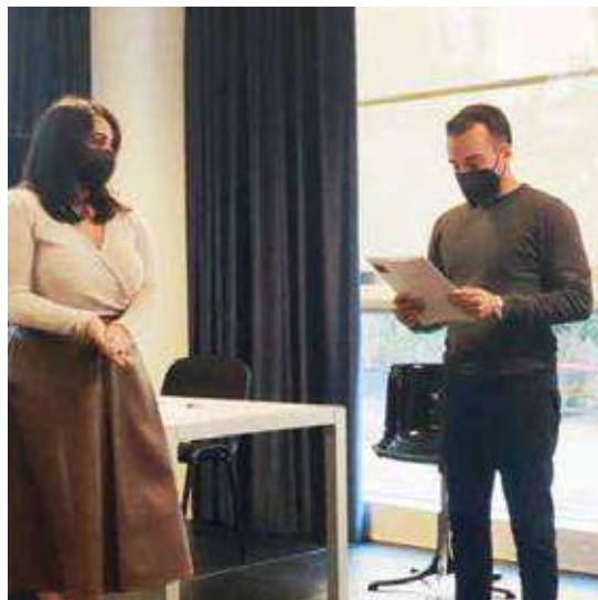
Graduation Ceremony For Master In Business Design

Lesson I Learned During My Time As A Student Is The Importance Of Building Strong Networks. Investing Time And Interest In Forging Connections With Professors And Fellow Students Can Open Doors To Exciting Opportunities.