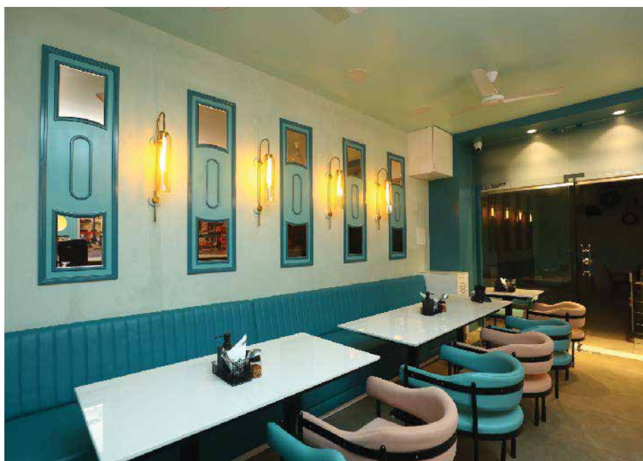
Photo of The Interiors of the Cafe

The Design Language Was To Achieve A Space With Enclosure And Linearity Through Different Forms Of Rectangles Yet Creating A Balance Where Different Rounded Rectangles Act As Different Memories In Pieces. Even Though Every Client Has A Different Budget, Vidhi Atelier Always Starts By Developing The Concept. Vidhi Atelier Merges A Modern Art Deco Language With A Classic Historical Style Tweaked And Rejuvenated To Mirror The Italian Spirit Of The Restaurant.