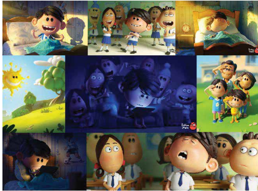
Stills From Disney Project Done At Vaibhav Studios

Mentors Etched The Core Of My Creativity. A Project, A Symphony Of Light And Shadows, Marked My Transformation Into A Storyteller Transcending The Boundaries Of Language And Culture.