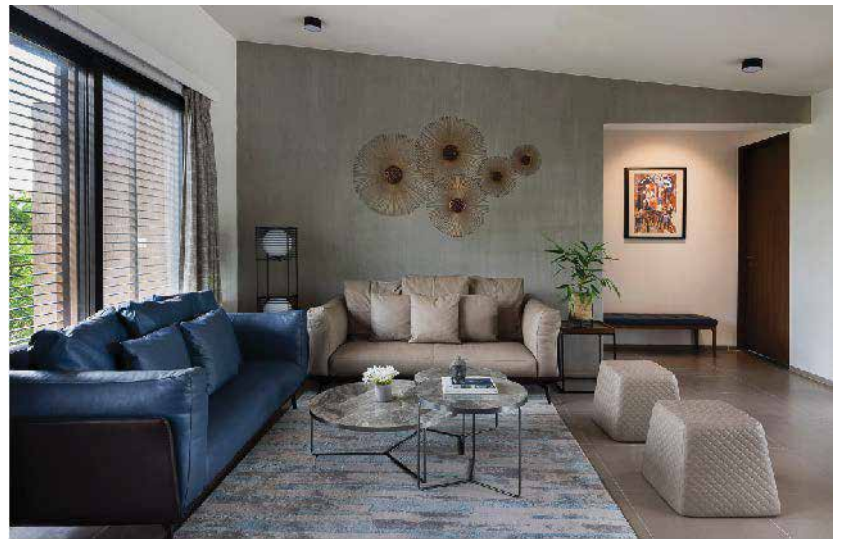
A Weekend Home Of Ahmedabad Published In Ad India Magazine.