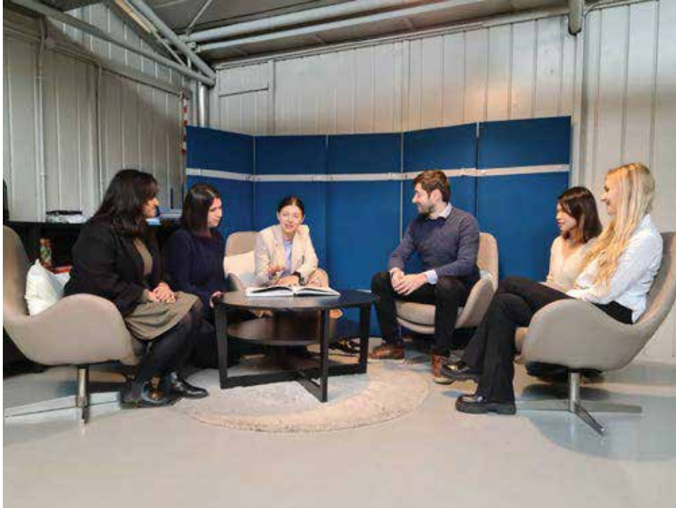
Curricular Internship At Fashion Technology Accelerator, Milan

After Successfully Launching This Project In 2022, I Was Fortunate Enough To Join The Company As A Consultant And Further Work With Their Prestigious Clients Such As Pepsico And Nestle. This Experience Has Been Nothing Short Of Extraordinary, Reinforcing My Belief That I Learn Something New Every Day.